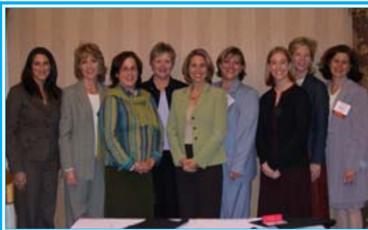
High Tea Awards Banquet Committee